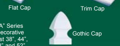
4" x 4" Post Caps

"A" Series Decorative Post 38", 44", 48" and 52" lengths