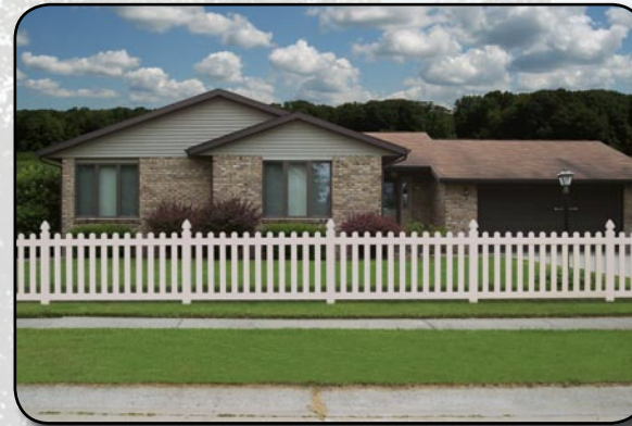
Good Neighbor Picket Fence