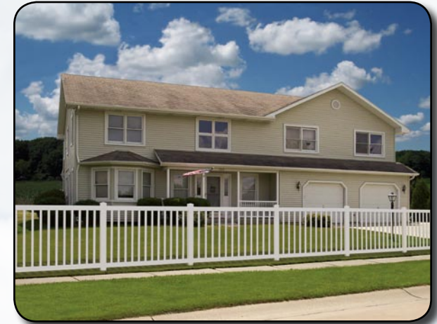
Good Neighbor Yard Fence