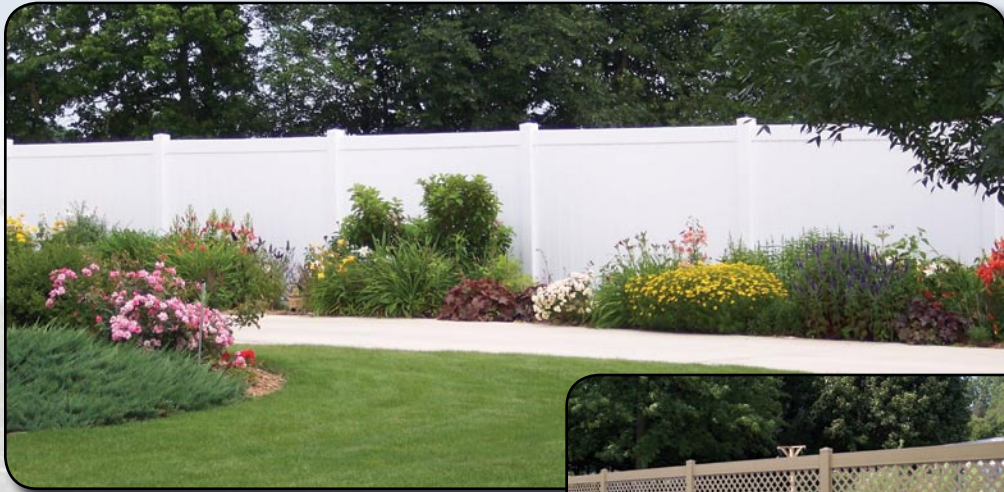
T&G Privacy Fence & Privacy Fence w/Lattice