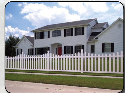
Good Neighbor Concave Picket Fence