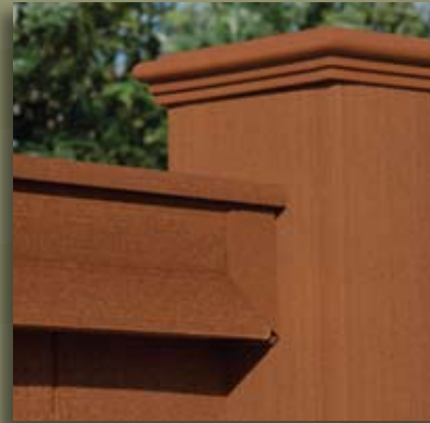
5-1/4" x 5-1/4" Post

TimberTech is a proud member of the U.S. Green Building Council. This coalition of leaders from the building industry works to transform the way communities are built and strives to create a socially responsible environment that improves quality of life.